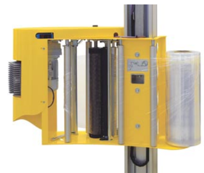
The Power Pre Stretch carriage is driven by belt lift and pre stretch wheels are easy to remove and change.